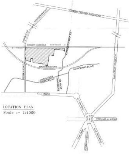
LOCATION PLAN Scale :- 1:4000